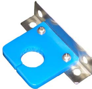
LEVEL PROBE BRACKET (SMALL), LPB-1